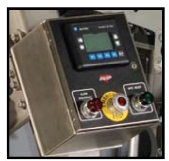
Machine Mounted Operator Control Station